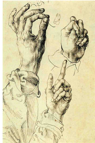
Hand sketches by Albrecht Dürer