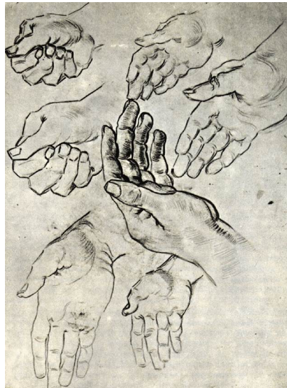
Hand sketches by Vincent van Gogh